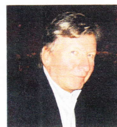
F. Paul Wilson Prometheus Awards Guest